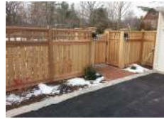
Custom framed panel