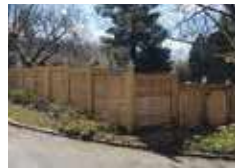
Trellis stepped to grade