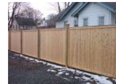
Framed T&G on 5x5 posts