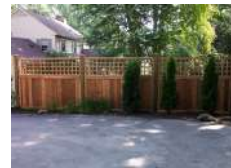
4" Square Trellis topper