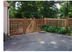
4" square Framed Trellis