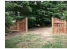
Trellis fence with entrance wings