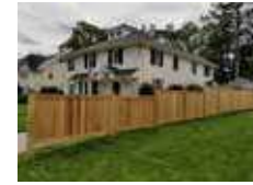
1" x 6" Framed T&G