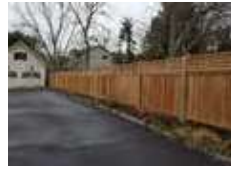
Framed T&G w/ Trellis Topper