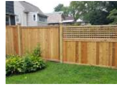
Framed T&G w/ & w/o Topper