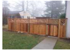
T&G with Lattice Topper