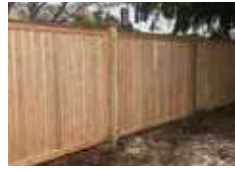
Framed Tongue and Groove

*Above represents standard dimensions, but all fences can be customized.