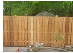
Pool Code 1"x6" Shadowbox