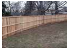
Inside of Cap & Face