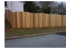
Domed 1"x4" Solidboard