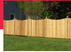
Scalloped Solid w/ FG Posts