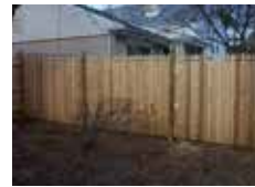
Solidboard on French Gothic Posts