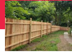
Inside View of Solidboard