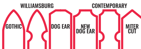
CAP & FACE TOPS