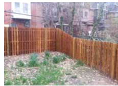
Shadowbox with Taper