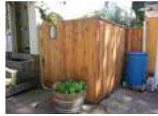
Capped Solid w/ Domed Gate