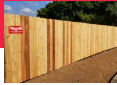
Dog Ear Solidboard

Stockade: We use a Premium #1 Spruce Stockade, which consists of 1x3 pickets with rounded front on spruce 2" x 3" backing rails. These panels are pre-fabricated and cannot be modified much.