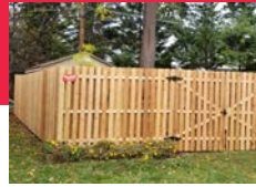
Dog Eared Shadowbox