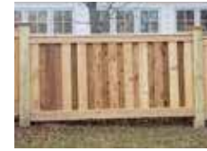
Custom Designed Shadowbox